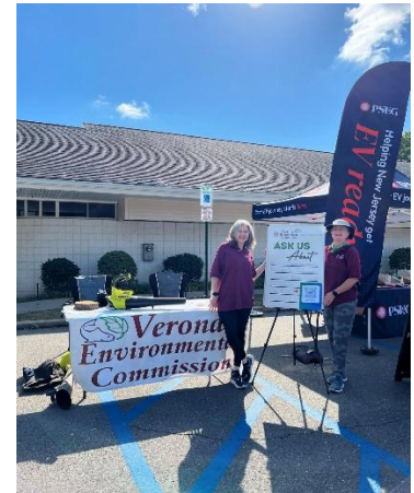
Electric Vehicle Fair