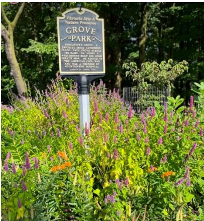
Grove Park Garden