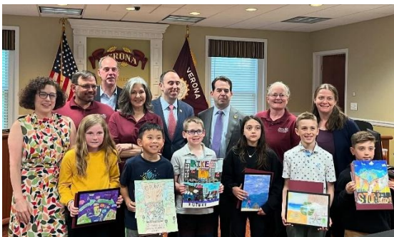
2024 Poster Contest Winners