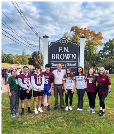
Walk To School Day