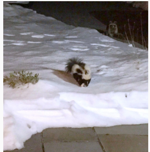
Skunk and Raccoon Winter 2018 Laning Section