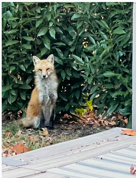
Red Fox Fall 2023 FN Brown Section