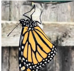
Monarch Butterfly Summer 2019 Laning Section

We can't wait to find out who's dropped by!